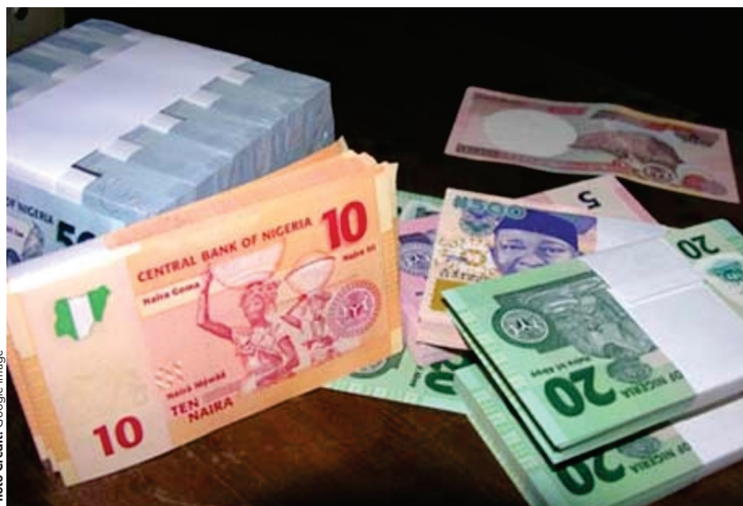
Naira Note Denominations